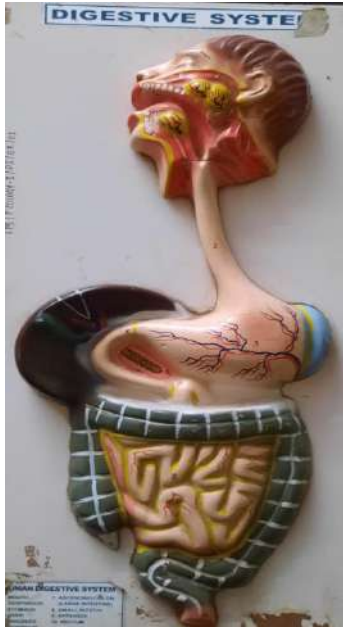
Model(Human Digestive System)